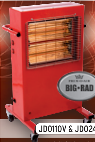
JD0110V & JD0240V